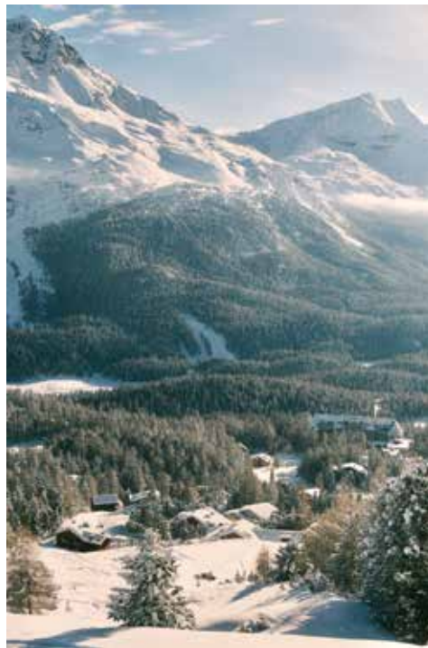
First light traces gentle arcs across the slopes above Sils—each turn a quiet dialogue with the mountain air.

Waldhaus is a retreat of alpine grace and heritage. Here, days end not in bustle or noise, but in thoughtful conversation, candlelit corners, and a refined calm that's increasingly rare. As Martin Mosebach once quipped, „The world might end tomorrow, but at the Waldhaus, you'd likely only hear of it a week later—from a porter's quiet mention.“