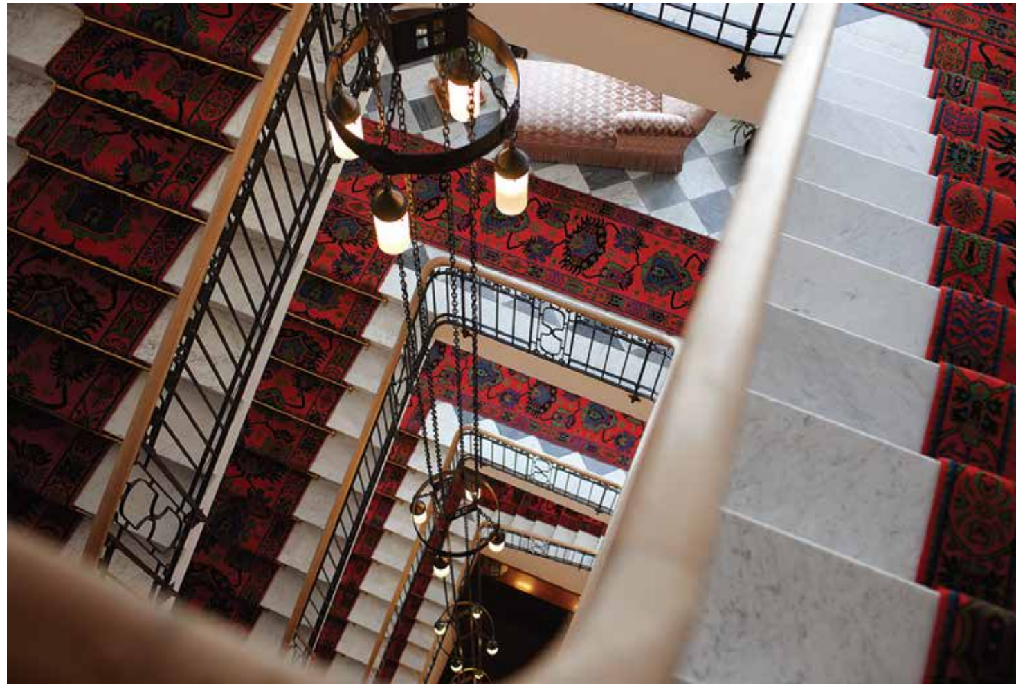
A restored Belle Époque staircase sweeps upward, seamlessly blending heritage with contemporary ease.

Dining at Waldhaus is just as varied. Choose between the grandeur of the main dining room, a quieter meal in the cozy à la carte restaurant, or savor reimagined classics in the light-filled modern pavilion.